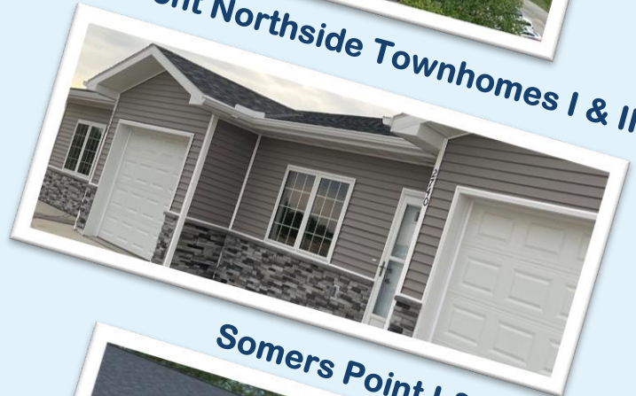
Fremont Northside Townhomes I & II