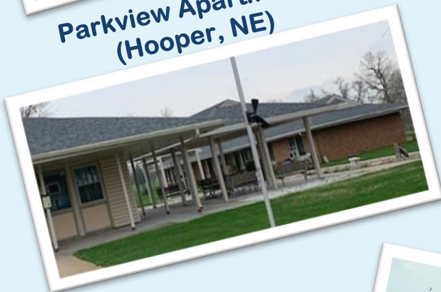
Parkview Apartments (Hooper, NE)